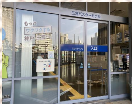
Sannomiya bus terminal entrance