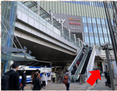
Sannomiya Bus Terminal (Mint Kobe 1F)