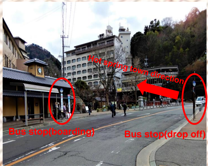
Bus stop (boarding)