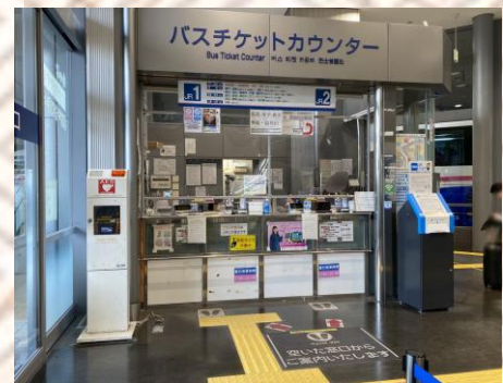
JR bus ticket counter